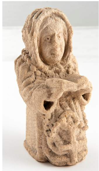
Carving of a monk reading [Moyse's Hall Museum]