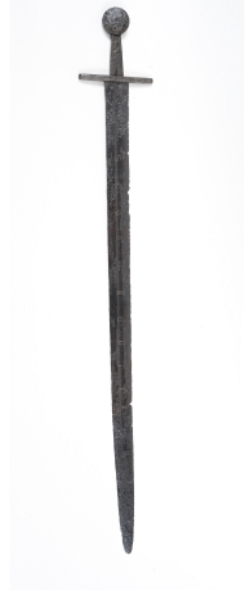
The Fornham Sword c.1173 [Moyse's Hall Museum]